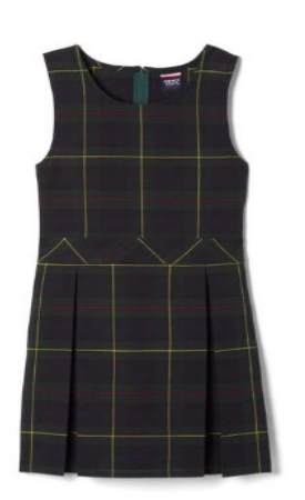
Jumper Dress in Approved Plaid