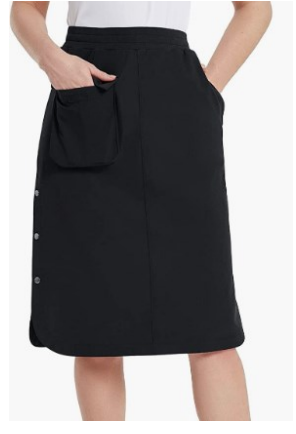
Knee Length Skirt