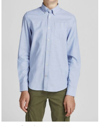
Oxford Button Down Shirt