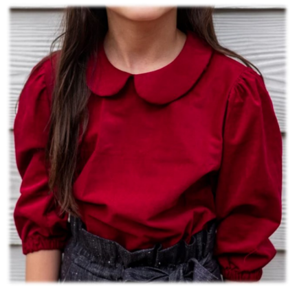
Peter Pan Collared Shirt